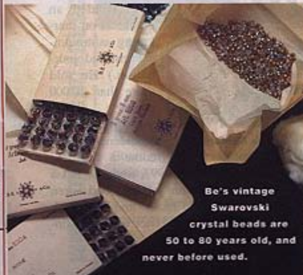
Be's vintage Swarovski crystal beads are 50 to 80 years old, and never before used.